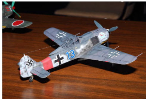
Hasegawa 1/48 FW-190A-8