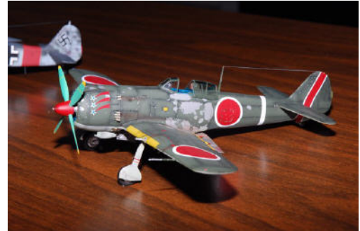
Hasegawa 1/48 KI-84 Frank