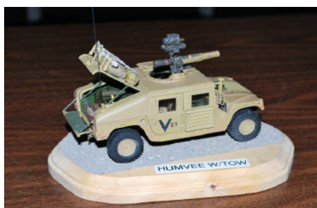
Rick Slagle Tamiya 1/35 Humvee W/TOW