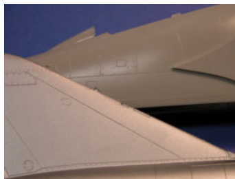
Photo 1. Scalecoat II sprayed directly on plastic with an unpainted part for comparison

One of my questions for Ken was how Scalecoat reacted with plastic, so my first test was to simply spray some on an old kit, in this case a Hasegawa F4-F. I mixed the paint to Scalecoat's recommendation, 1/3 thinner to 2/3 paint, and sprayed it at about 10psi in light coats. The result is shown on photo 1. The paint showed no ill effects on the plastic at all and dried quickly to a matt aluminum finish. The finish was a bit too flat looking, but a light buff with tissue paper left a smooth surface resembling oxidized metal. As a final test I turned one part over and flooded it with the thinned mixture. There was no sign of any reaction with the plastic.