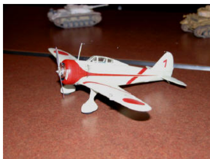
Bill Weckel's sharp little KI-27