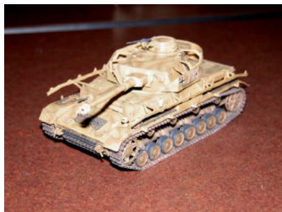
Two more 1/48 scale targets.... I mean, tanks, by Al Imler