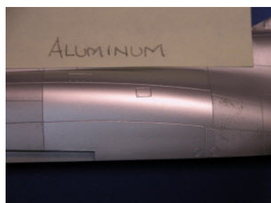
Photo 2&3. Good results obtained with Alclad Aluminum and Airframe Aluminum. Note the slight lifting of the paint on the right hand side.

One of my questions for Ken was how Scalecoat reacted with plastic, so my first test was to simply spray some on an old kit, in this case a Hasegawa F4-F. I mixed the paint to Scalecoat's recommendation, 1/3 thinner to 2/3 paint, and sprayed it at about 10psi in light coats. The result is shown on photo 1. The paint showed no ill effects on the plastic at all and dried quickly to a matt aluminum finish. The finish was a bit too flat looking, but a light buff with tissue paper left a smooth surface resembling oxidized metal. As a final test I turned one part over and flooded it with the thinned mixture. There was no sign of any reaction with the plastic.