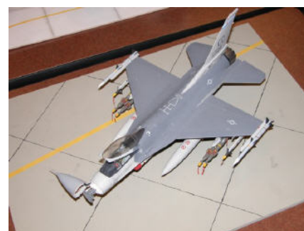
Another view of the contest winning F-16C