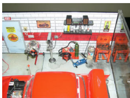
Check out the details