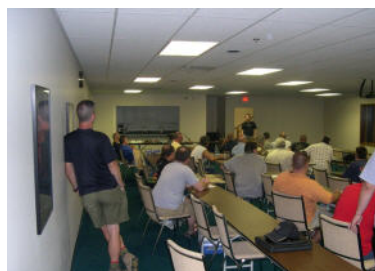
Above: Our new meeting room is not short on space or lighting.