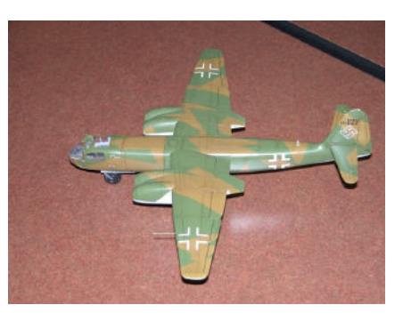
Arado AR-234