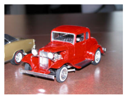
'32 Ford Street Rod

Kudos to everyone who graced the tables with models. Fame Cities is consistently turning out a dazzling array of models each month, even in mid-summer. This is traditionally not a prolific time of year for model building. We clearly have a group of exceptional builder assembled here.