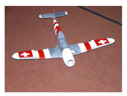
ME-109 in Swiss markings