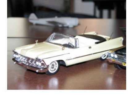
'59 Chrysler Imperial