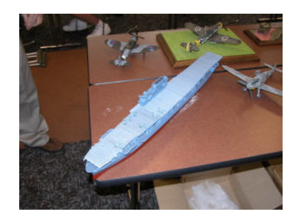
Gary Wolfe's methodically progressing Yorktown