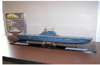
Gary Wolfe's impressive USS Enterprise